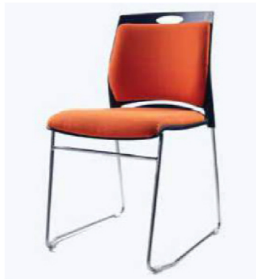
Chair Size: W17"xD19"xH31"