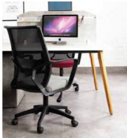
Workstation Size: L96"xW48"xH30"