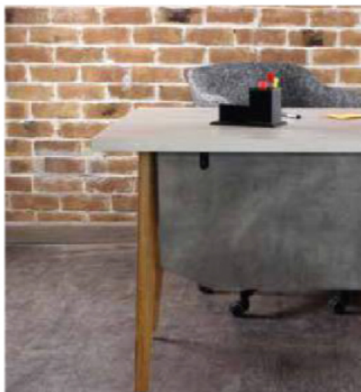
Also Available in L48"xW24"xH30"