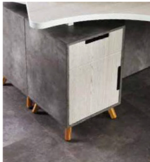
Unit Size: W16"xD16"xH26"