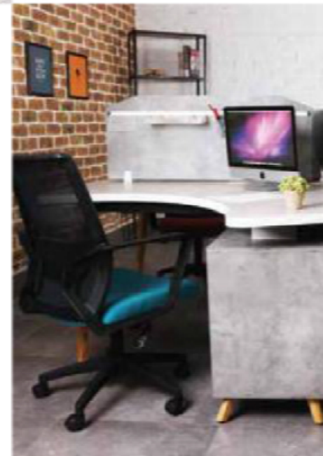
Workstation Size: L96"xW96"xH30"