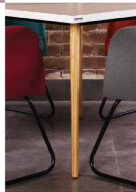
Available in L48"xW48"xH30"