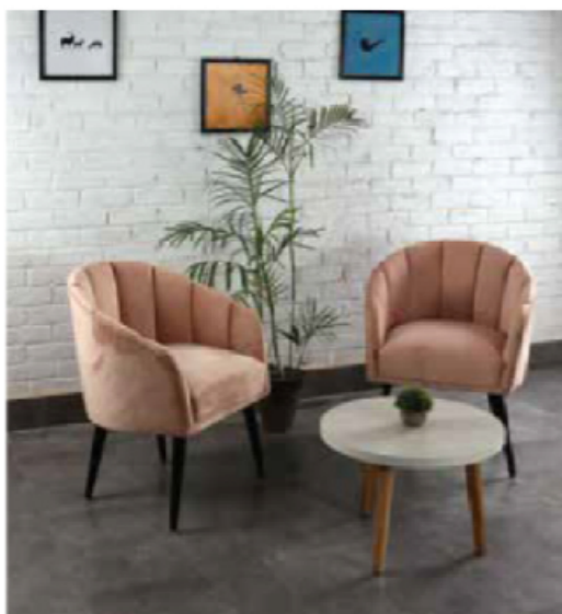
Available in Different Colors