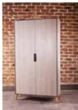
Smart Full Height Cabinet W36"xD16"xH67"