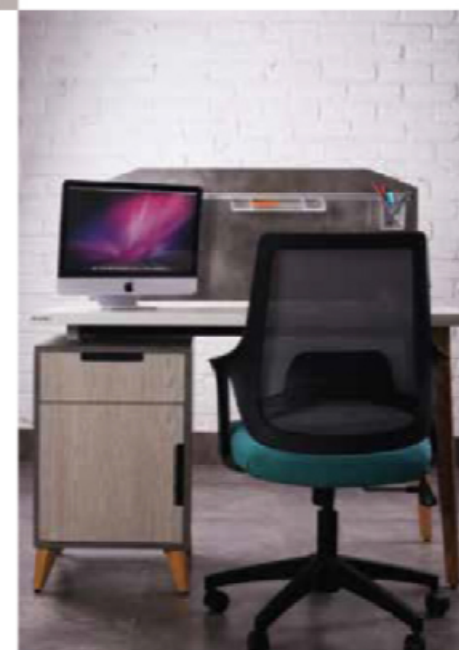
Workstation Size: L48"xW24"xH30"