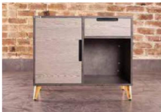
Smart Basic Siderack L36"xD16"xH26"