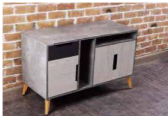
Smart Executive Siderack L42"xD18"xH26"