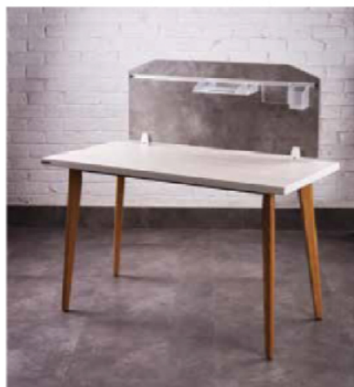
Workstation Size: L48"xW24"xH30"-15"