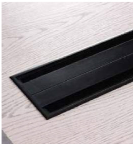
Brush Grommet for Wire Organizing