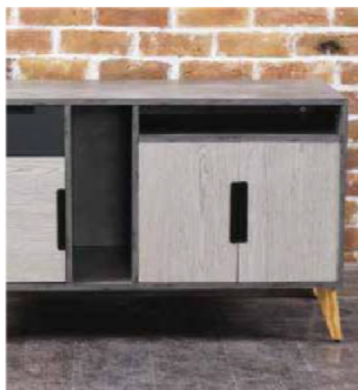
Side Rack Size: L42"xD18"xH26"