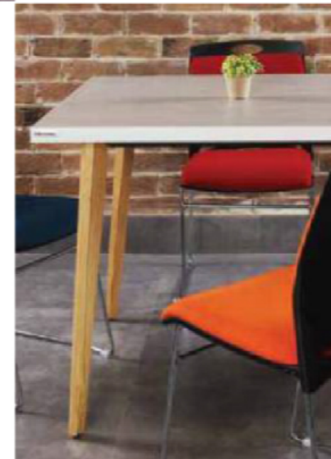
Also Available in L48"xW48"xH30"