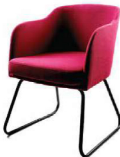
Chair Size: W24"xD24"xH34"