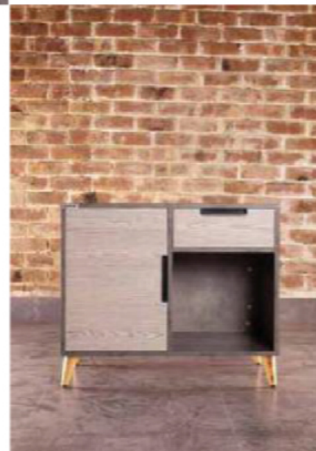
Basic Side Rack: L36"xD16"xH26"