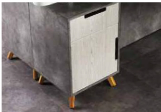
Smart Mobile Pedestal W16"xD16"xH26"