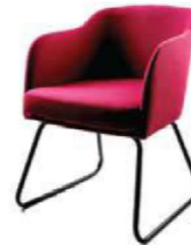
New Scoop Chair