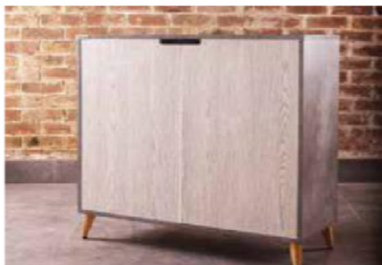
Smart Small Height Cabinet W36"xD16"xH36"