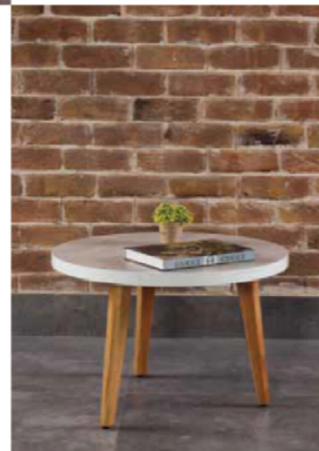
Table Size: 24" Dia