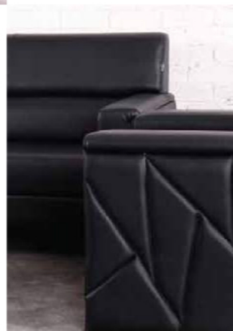
Triple Seat: W79"xD30"xH36"