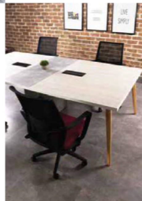
Available in Customized Sizes