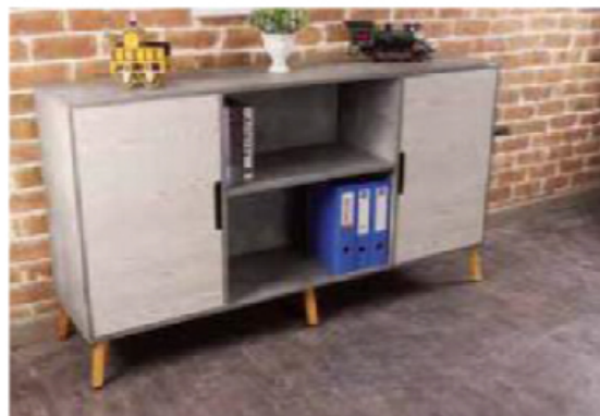
Smart Credenza L66"xD16"xH36"