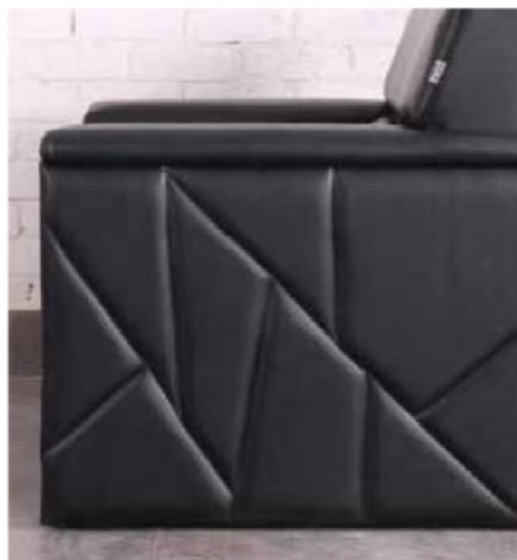
Double Seat: W56"xD30"xH36"