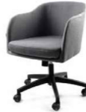
New Scoop Revolving Chair