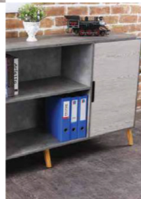
Credenza Size: L66"xD16"xH36"